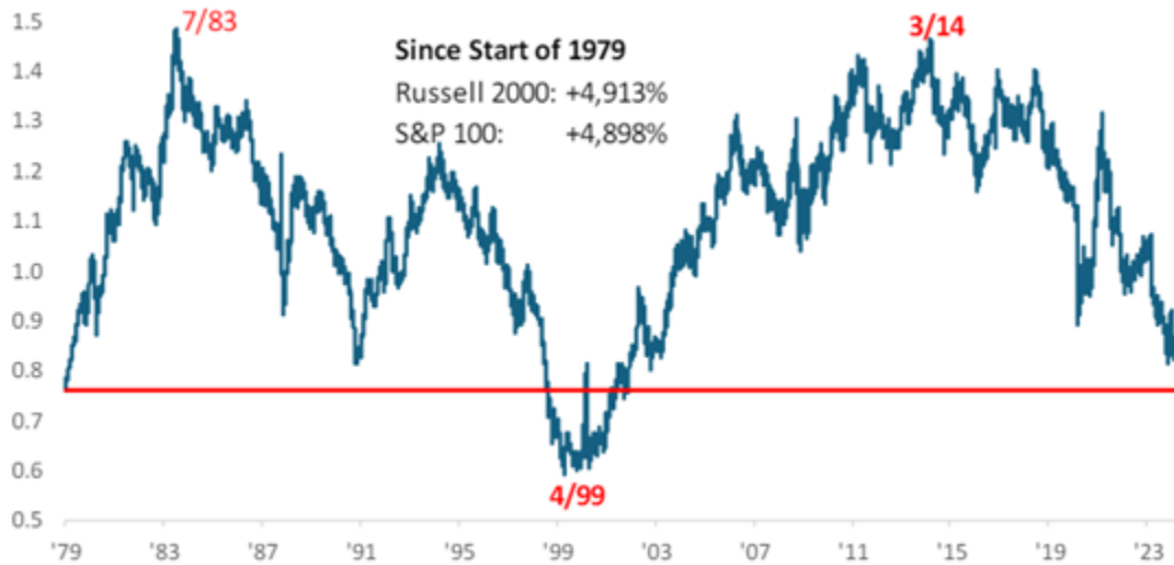
Exhibit 2. Ratio of Russell 2000* vs. S&P 100: 1979 - 2024

Source: Bespoke Research. Red line indicates start and end points.