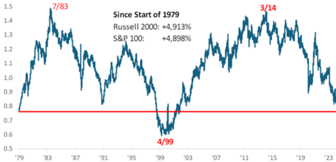
Exhibit 2. Ratio of Russell 2000® vs. S&P 100: 1979 - 2024

Finally, we are asking ourselves, might history repeat or at least rhyme. The chart below compares the performance of the Russell 2000® smaller companies index to the S&P 100 large-cap index.