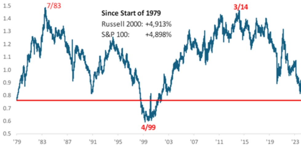
Exhibit 2. Ratio of Russell 2000® vs. S&P 100: 1979 - 2024

Finally, we are asking ourselves, might history repeat or at least rhyme. The chart below compares the performance of the Russell 2000® smaller companies index to the S&P 100 large-cap index.